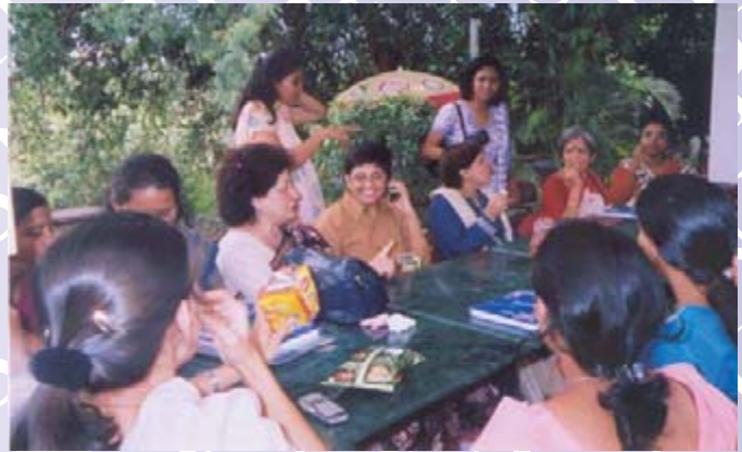
LPF share some informal moments with Dr. Kiran Bedi at Talkatora Baug, Delhi