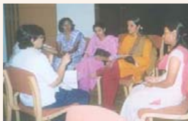
Inspira team brainstorming over the next issue

The year has been a smooth sailing as for the first time, a series of commendable programs were arranged by the LF's in perfect synchronization with the torch bearers of the foundation. Together, let us continue to march forward to a promising future, so that the century truly belongs to us!