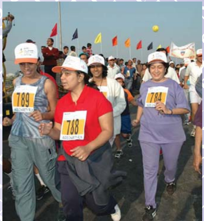
A run for a cause: LFF at "The Hutch Pune International Marathon 2005 - Race against AIDS"