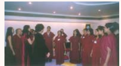
"Celebrating the New Women" LFs visit the OSHO Commune

A programme to learn to celebrate who we are, discover the beauty, creativity and softness of the feminine principle through sharing, relaxing and simple meditations