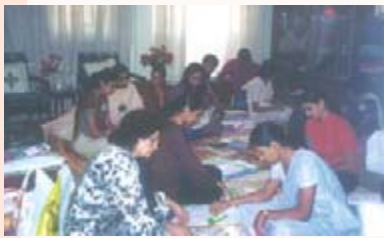
LFs engrossed in learning and playing scrabble

We would like to share these joyful events once again with our well-wishers, friends and all the readers of Inspira.