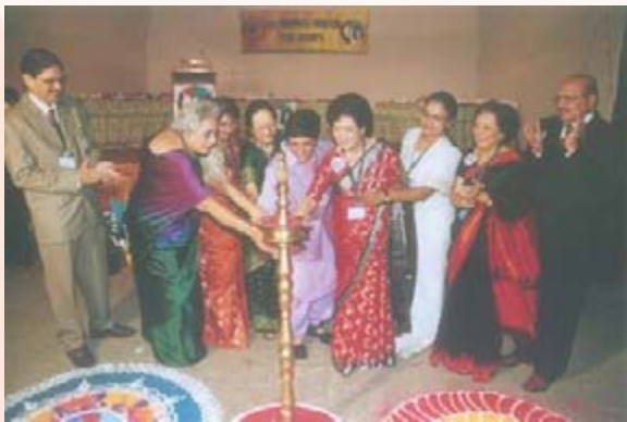
Dr. Kiran Bedi, the Guest of Honour joins the trustees in lighting the inaugural lamp at the 10th Award Function -2005

The year 2005 was a special year for The Lila Poonawalla Foundation, as it celebrated A Decade of Existence - the tenth anniversary of the LPF with the rare and unique chief guest Dr Kiran Bedi - History repeating after 10 years. What an evening that was! Past and present awardees proudly stating them as Lila Fellows all under one roof meeting and sharing their achievements. The hall crowded with senior Lila fellows, their parents, spouses and the Trustees interacting with them, to know the latest in each one's lives - emotions and happiness had no boundaries.