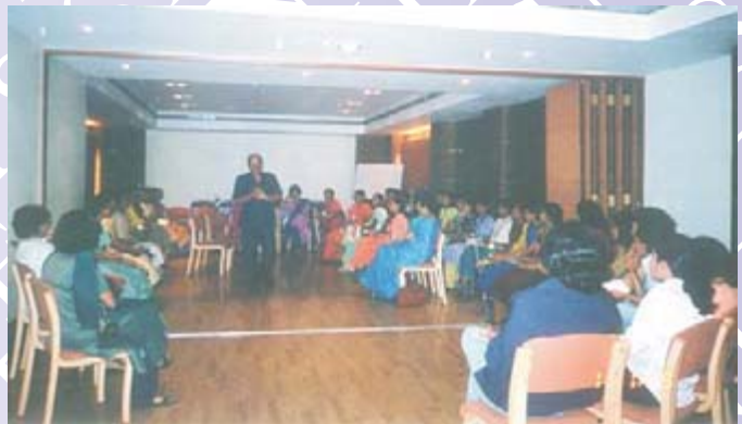
The foundation welcoming the LF's-2005 into the family at the Tea Party