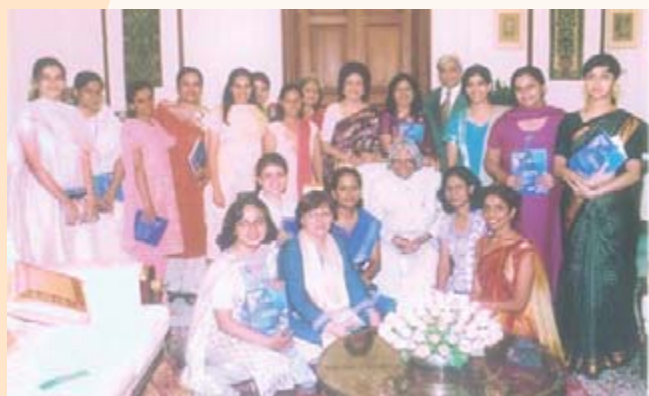
A proud moment frozen in time.....LPF with Honourable President of India - Dr. A. P. J. Abdul Kalam!

Gandhi in the hall. The dining arrangement is very systematic and the sitting capacity is 104. A particular protocol is followed when the food is served. All the Former President's Paintings and the numerous weapons from 1963 are neatly arranged