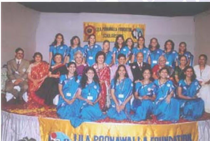
LF Volunteers for the 10th Award Function with Dr Kiran Bedi and the trustees