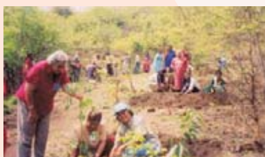
"Tree Plantation Drive" by the Lila Poonawalla Foundation

Tree Plantation : To create awareness among the Lila Fellows that tree planting is important for conservation of environment, LPF arranged Tree Plantation programme with the support of Vanarai. Lila Fellows and Trustees planted 100 trees.