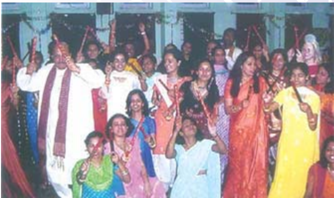
The LF's in synch at the "Dandiya Raas"