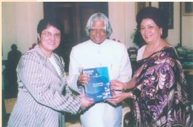
Book "21st Century Belongs to Them" being presented to the President of India - Dr. A. P. J. Abdul Kalam

B est things happen when you least expect them. I am sure none of the Lila Fellows ever thought that they would ever be able to meet their most favourite President. It was a dream comes true for all of us.